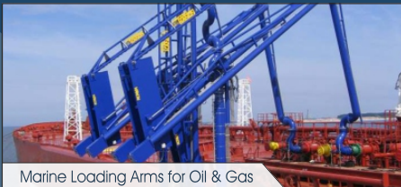
Marine Loading Arms for Oil & Gas