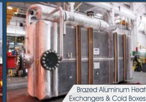
Brazed Aluminum Heat Exchangers & Cold Boxes